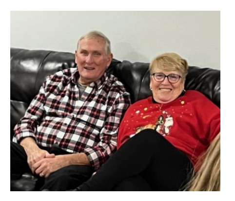
The IMC Christmas Party was again a great time for all that attended. Compliments to the chefs that brought in all the delicious food again this year. This year we had a special guest with a miniature Santa who brought Indy Mopar Club January 2025 Newsletter Page 2